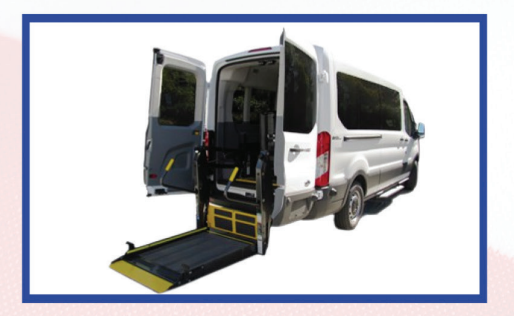
Ford Transit up to 14 passengers

12950 Koch Lane Breese, IL 62230 &+618-526-4131