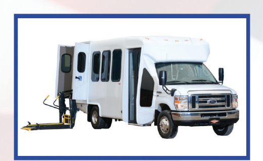
Diamond Coach Wheelchair Bus