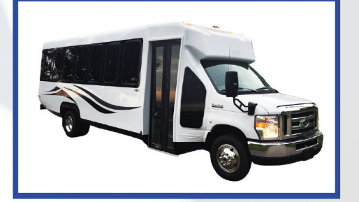
Diamond Coach Bus 10-36 passengers