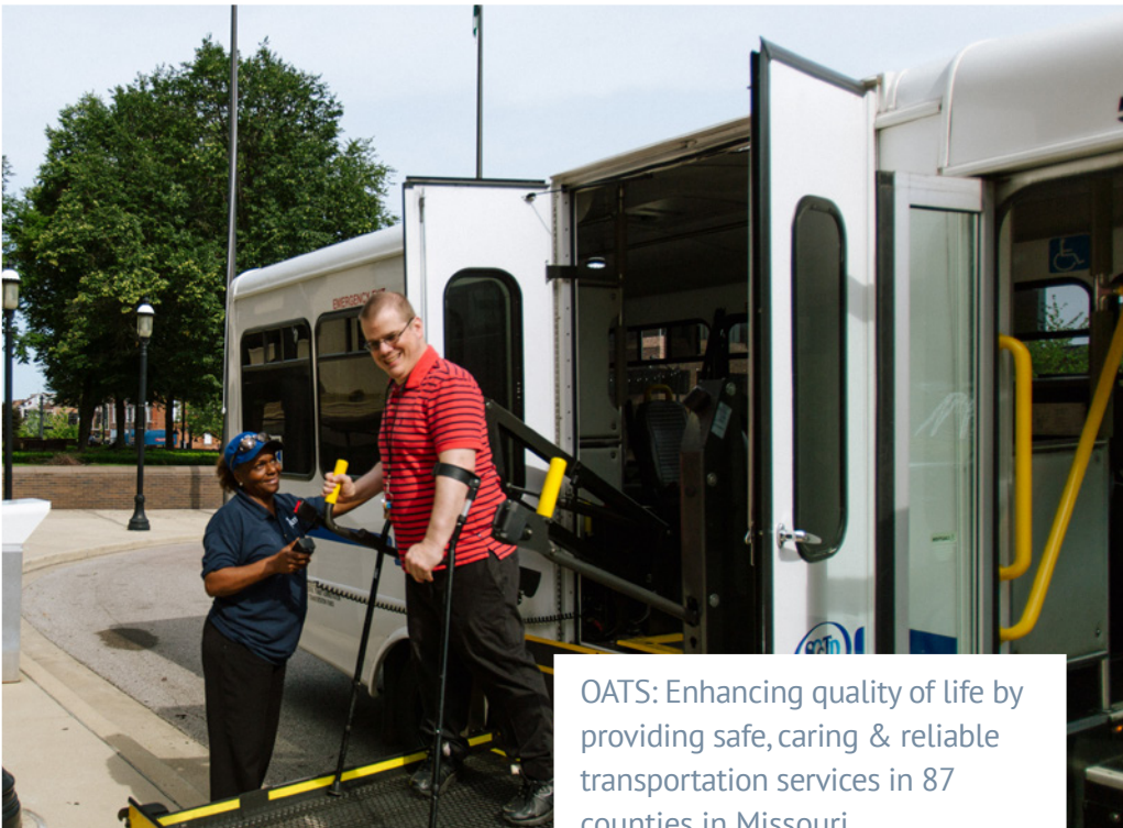
OATS: Enhancing quality of life by providing safe, caring & reliable transportation services in 87 counties in Missouri.

1010 Wildwood Drive Dexter, MO 63841 P: (573) 624-8624 F: (573) 624-2196 E: stoddardcounty_transit@nwcable.net